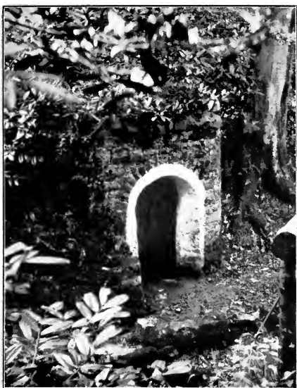
THE DEAN'S WELL AT GOSFORD CASTLE